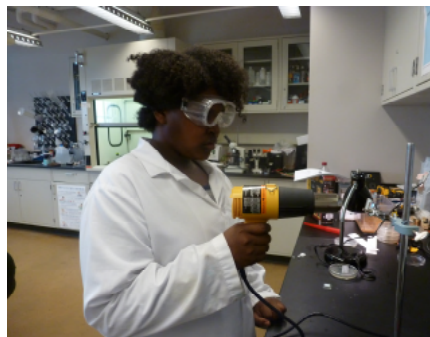
Isis using heat gun to produce photosynthesis reaction on surface of solar cell